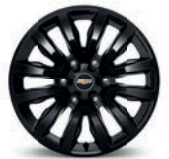
Alloy Wheel 18" with 265/60 R18 Tire