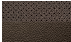
Leather / Leatherette