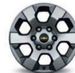
Alloy Wheel 17" with 255/65 R17 Tire For LT A/T 4x2