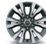
Alloy Wheel 18" with 265/60 R18 Tire For LTZ A/T 4x2 and LTZ A/T 4x4